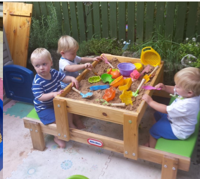
Enjoying sand play