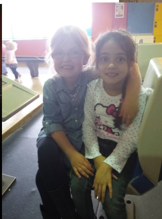
During the autumn half-term a large group of us went bowling in Chatham.