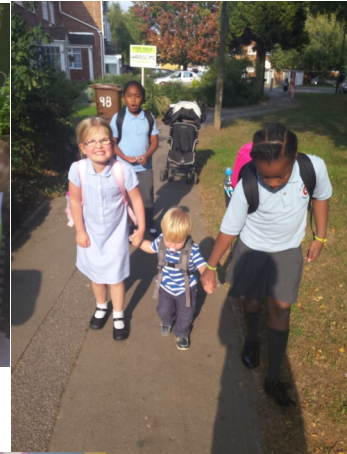
All Joining in with the school run!